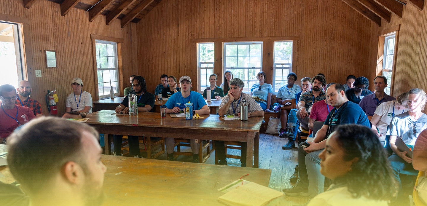
PARTNERS CONNECTED WITH LOCAL PLANNING EXPERTS AT VCN'S ANNUAL MEETING & PARTNER RETREAT