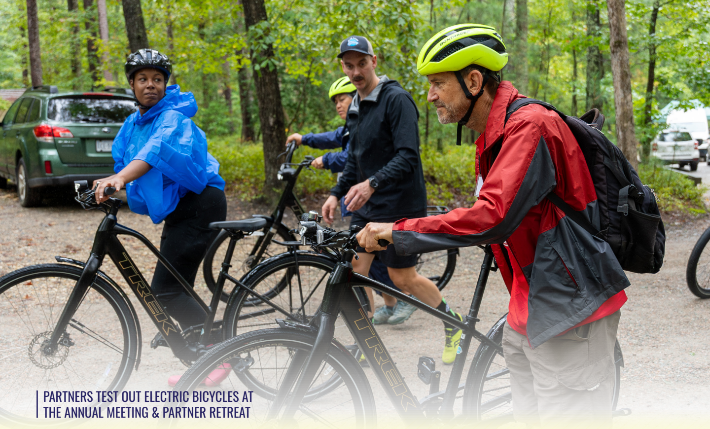
PARTNERS TEST OUT ELECTRIC BICYCLES AT THE ANNUAL MEETING & PARTNER RETREAT

Alliance for the Chesapeake Bay Alliance for the Shenandoah Valley American Battlefield Trust Bike Walk RVA Chesapeake Climate Action Network Coalition for Smarter Growth Community Climate Collaborative Drive Electric RVA East Coast Greenway Alliance Generation180 Greater Richmond Fit4Kids Mothers Out Front National Parks Conservation Association Northern Virginia Families for Safe Streets