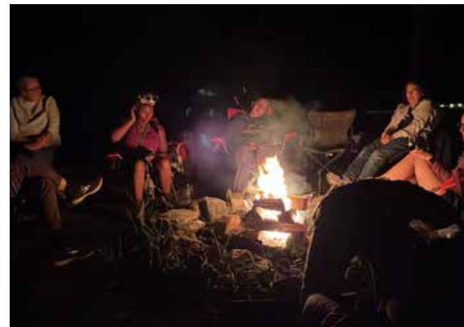
Partners ended the evening by making smores at the campfire.