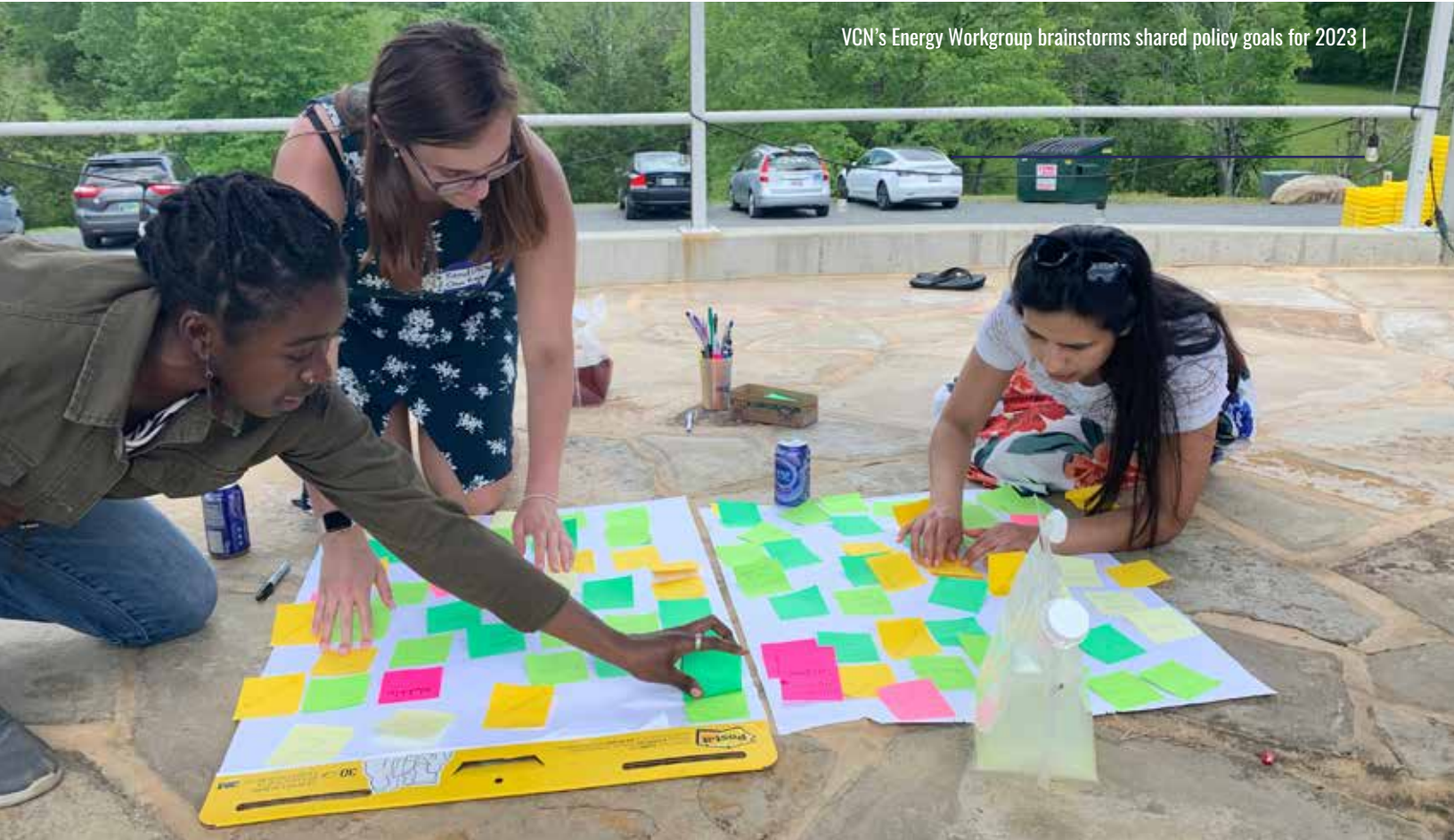
VCN's Energy Workgroup brainstorms shared policy goals for 2023 |