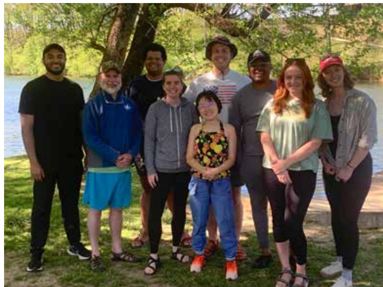
VCN paddled along Seven Bends State Park at our staff retreat in Shenandoah, Virginia