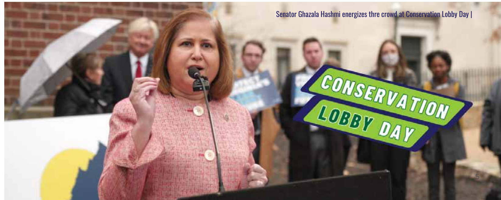
Senator Ghazala Hashmi energizes the crowd at Conservation Lobby Day |

We caught the action on film this year - check out our video recap at https://bit.ly/vcnlobbyday2023 .