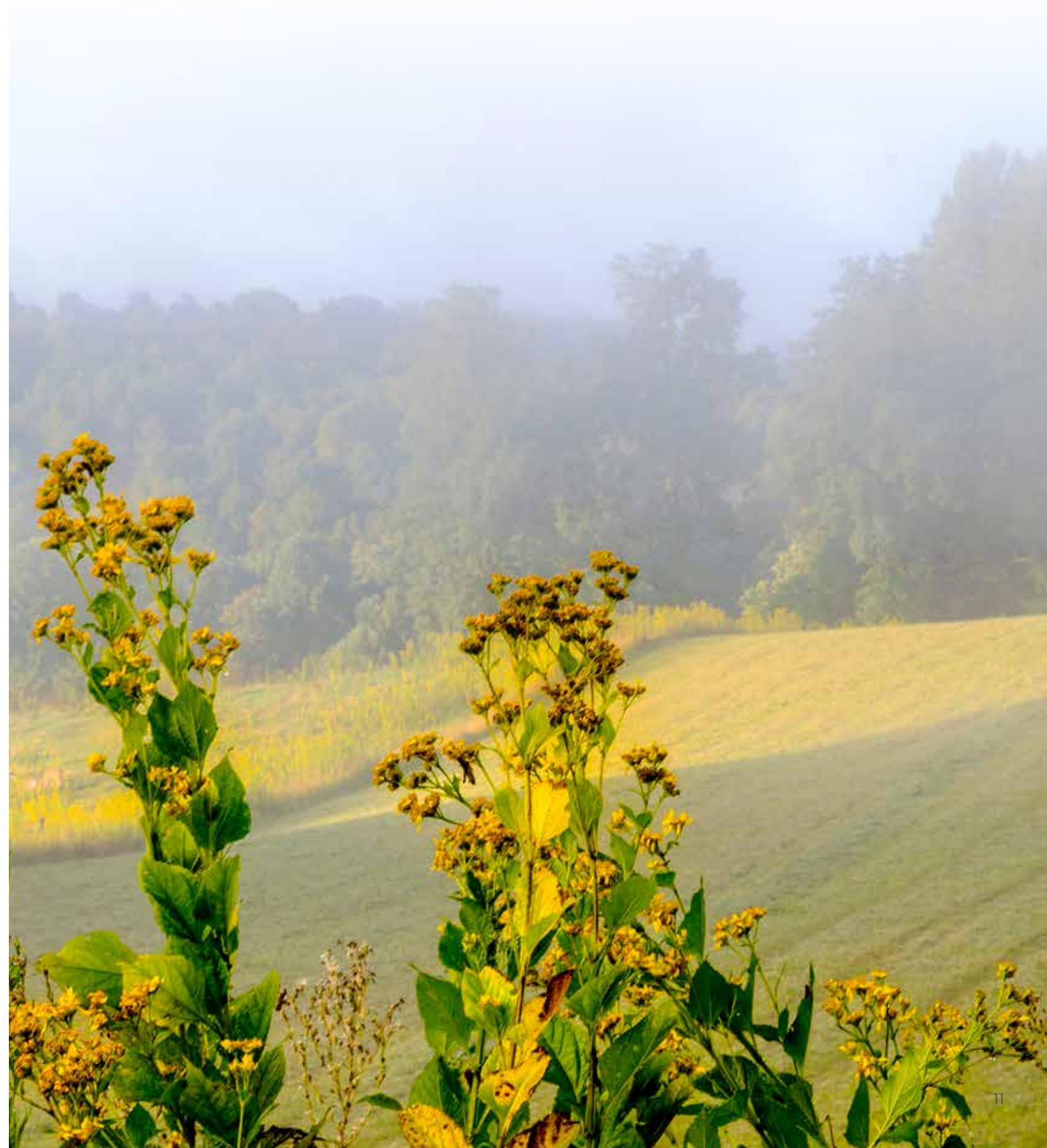
Umber Dawn, Bull Run Overlook.

Alliance for the Shenandoah Valley American Battlefield Trust Black Family Land Trust Blue Ridge Prism Capital Region Land Conservancy Chesapeake Conservancy East Coast Greenway Alliance Friends of the Dahlgren Railroad Heritage Trail James River Association National Parks Conservation Association New River Land Trust Northern Virginia Conservation Trust Piedmont Environmental Council Preservation Virginia The Nature Conservancy Virginia Association for Biological Farming Virginia Capital Trail Foundation Wild Virginia Wildlands Network