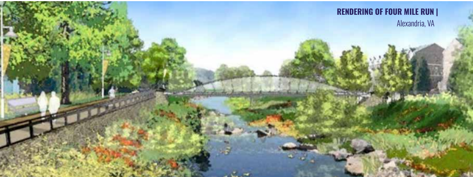
RENDERING OF FOUR MILE RUN | Alexandria, VA

Properties along two intersections in Alexandria's Four Mile Run watershed experience repetitive flooding as a result of the city's overwhelmed storm sewer systems. This holistic CFPF project will create new flood mitigation infrastructure that incorporates nature-based solutions to protect local homeowners and businesses while simultaneously enhancing the urban environment.