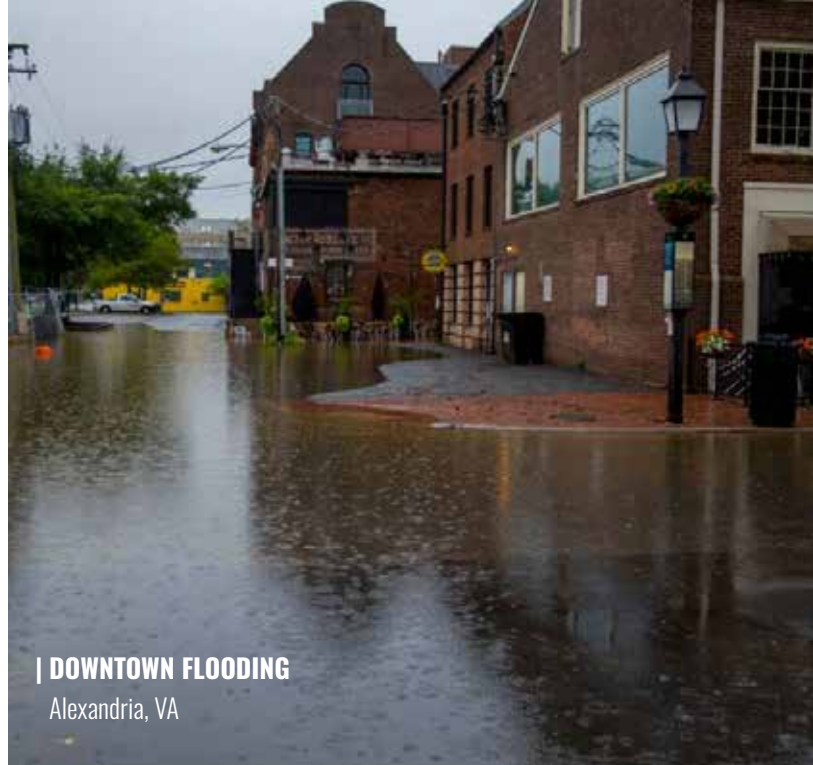
| DOWNTOWN FLOODING Alexandria, VA

Alexandria's bustling waterfront experiences an average of one flooding event per month, causing significant damage to businesses, homeowners, and city infrastructure along the Potomac River. This CFPF grant will support the City in implementing the design and engineering phase of its larger Waterfront Implementation Project, targeting the most vulnerable drainage basins slated for improvement. The city will work with a consulting team to design alternative mitigation approaches that incorporate nature-based solutions in addition to traditional grey solutions to stabilize the shoreline, maintain a resilience floodplain, and create a recreational area for the community.