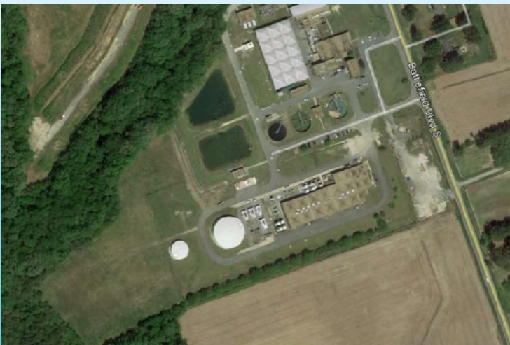
SOUTHERN CHESAPEAKE WATERSHED, NORTHWEST RIVER TREATMENT PLANT | Chesapeake, VA

Chesapeake is in the process of studying all major watersheds within the locality to assess flood risk and develop prevention and mitigation strategies. The City’s Southern Chesapeake watershed includes a portion of the Northwest River, a major drinking water source for the city. Flooding of this region in April of 2021 prompted the need for an accelerated evaluation of the rural region, which will be completed with a $91,404 CFPF grant.