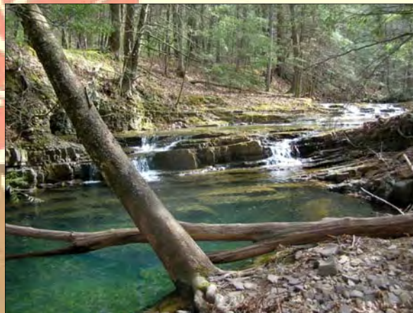
A cascading stream on Shenandoah Mountain.

A recent report by Wild Virginia, The State of Our Water: Managing and Protecting the Drinking Water Resources of the GWNF , describes the tremendous importance of the GWNF as a source of public drinking water. More than 22 communities in western Virginia obtain some or all of their drinking water from surface waters of the GWNF. The watersheds providing this drinking water cover approximately 44% of the GWNF land in Virginia. As a result of the report, Virginia Conservation Network and 32 other organizations (including 14 localities) adopted resolutions calling on stronger protection of drinking water resources in the national forest.