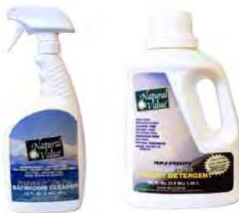
Eco-friendly Cleaning Products