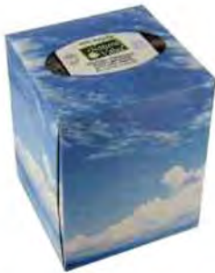
100% Recycled Paper Products