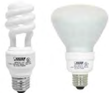
CFL Light Bulbs