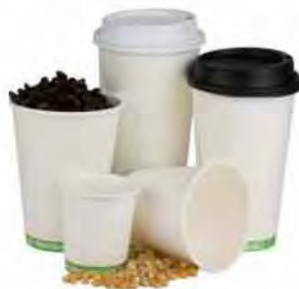
Compostable Cups, Plates & Utensils