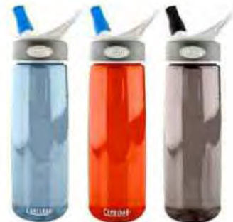
BPA-free Water Bottles

A t LetsGoGreen.biz we have a great selection of “green” products for every home, office or business. From water conservation products to energy-saving CFL light bulbs, biodegradable plates, cups and utensils, BPA-free water bottles, natural cleaning products, recycled paper goods and more, you’ll feel great knowing your purchase helps save energy and reduces your carbon footprint while helping to support your favorite fundraiser. Order today and 25% of your purchase will go to our group at checkout.